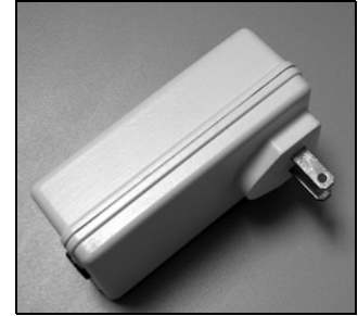
Optional DC Power Supply, 18-Volt PCN 2989038000 (Does not include wire. Modular wire length must be selected and ordered separately)