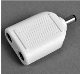
18 Volt Daisy Chain Y Adapter PCN 2989875000