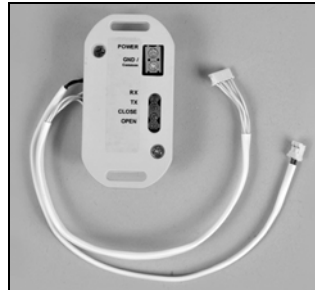
Connection Interface PCN 4254220003