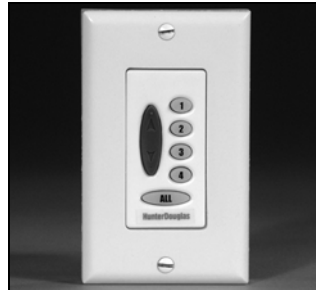
Platinum Wireless Wall Switch PCN 2986350000