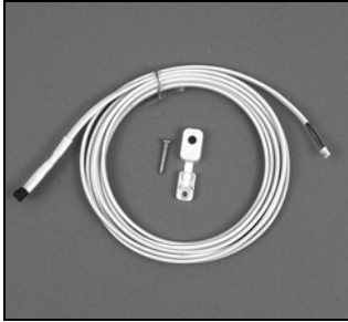
External Eye - 20" Wire PCN 4151187002 External Eye - 4' Wire PCN 4151188002 External Eye - 8' Wire PCN 4151189002