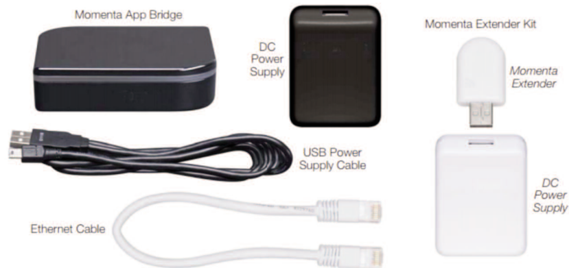
Momenta App Bridge Kit (Includes One Momenta Extender Kit)